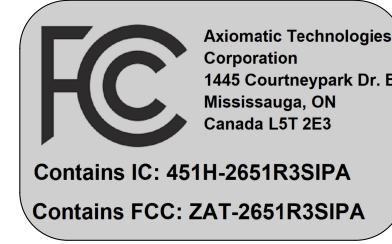
FCC ID label