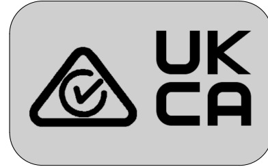
UK compliance label

TE Deutsch DT04-6P molded in receptacle mates with DT06-6S all variations