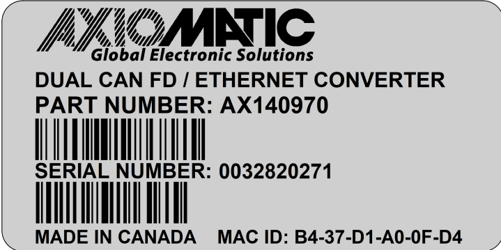
bottom side label